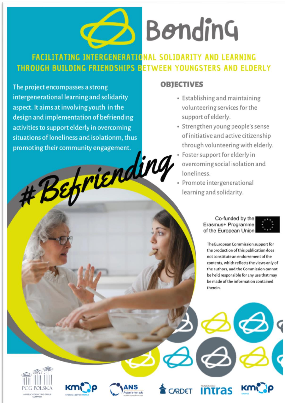
Figure 1 Poster (English version)