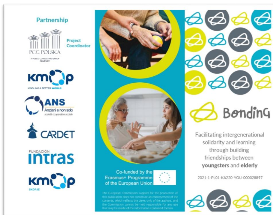
Figure 3 Leaflet - back page (English version)